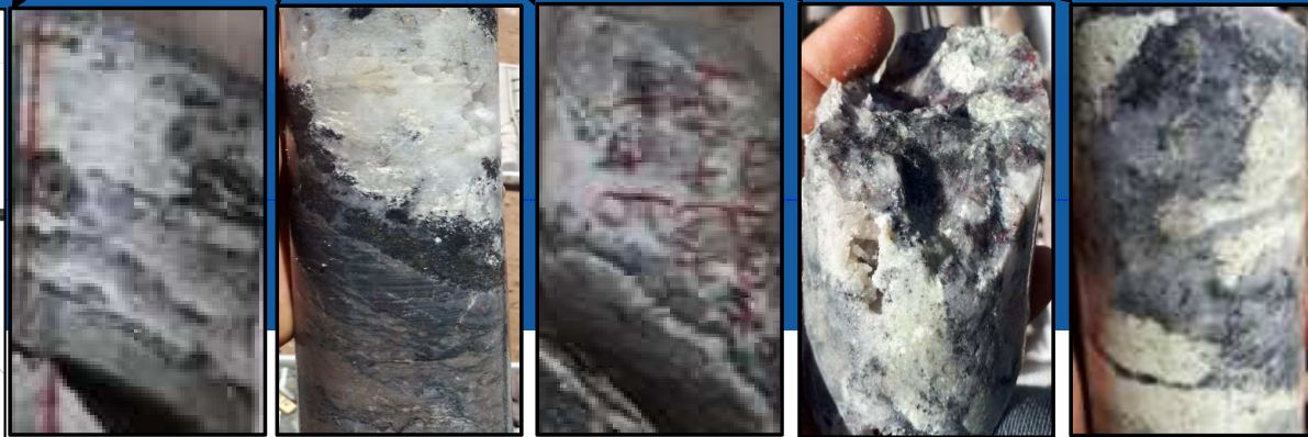
Core with High-Grade Banded and Crystalline Argentite and Pyrrargyrite (Silver Sulphides)