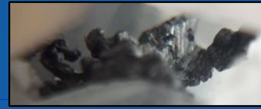
BAN18-06; Close Up of Silver Sulphide Crystals