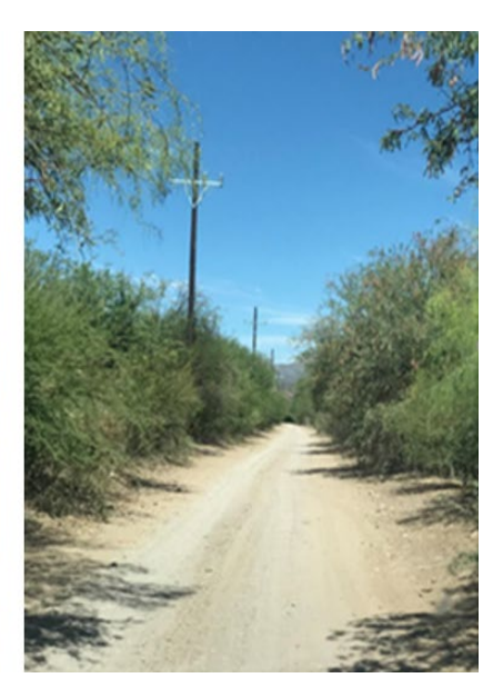
Figure 5: Powerline Pole Installation