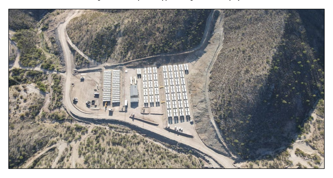
Figure 8: Las Chispas (Single Occupancy Room) Construction Camp