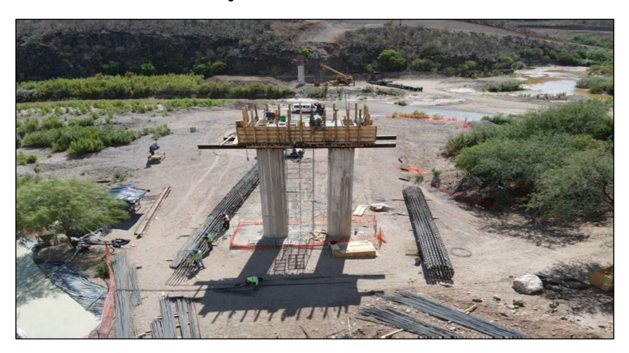
Figure 6: Bridge Construction