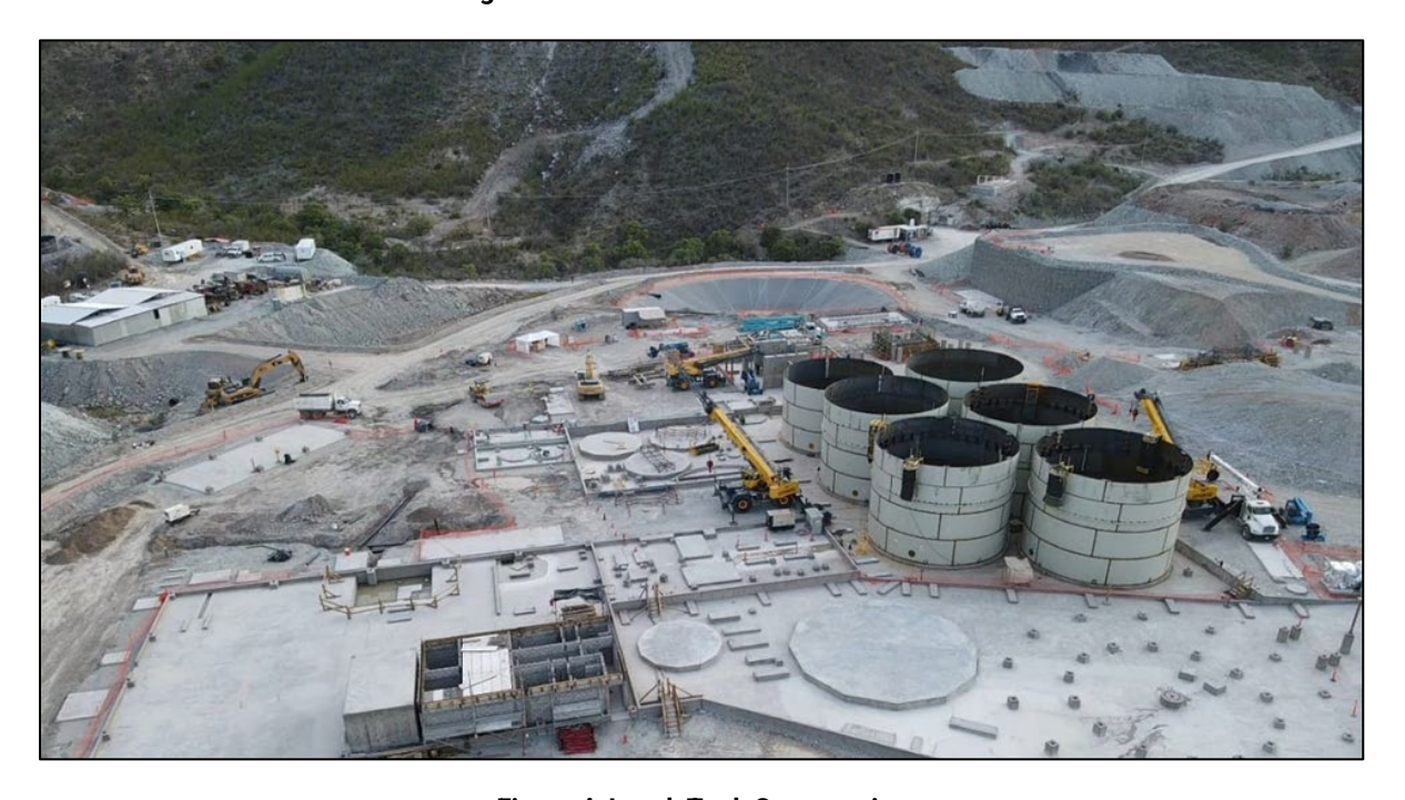
Figure 4: Leach Tank Construction